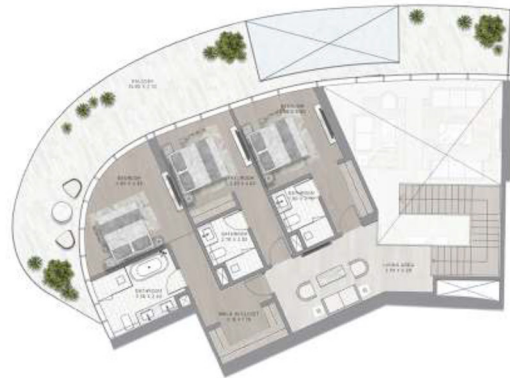
3-BEDROOM SUPER LUXURY LOWER & UPPER SALEABLE AREA: 4591 SQFT