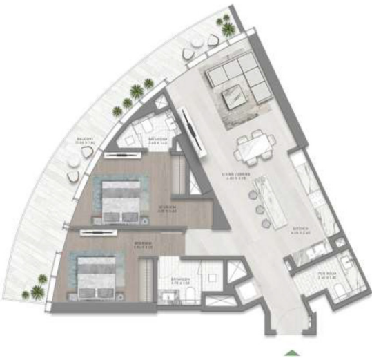
2-BEDROOM SALEABLE AREA: 1475 SQFT