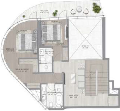
2-BEDROOM LOWER & UPPER SALEABLE AREA: 3961 SQFT