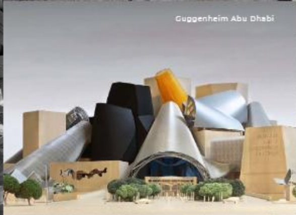
Guggenheim Abu Dhabi