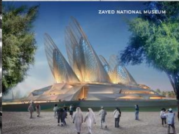
ZAYED NATIONAL MUSEUM