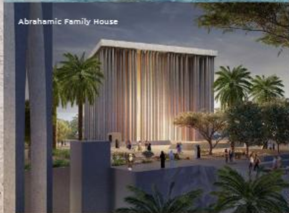
Abrahamic Family House