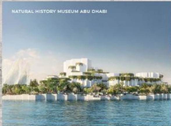
NATURAL HISTORY MUSEUM ABU DHABI