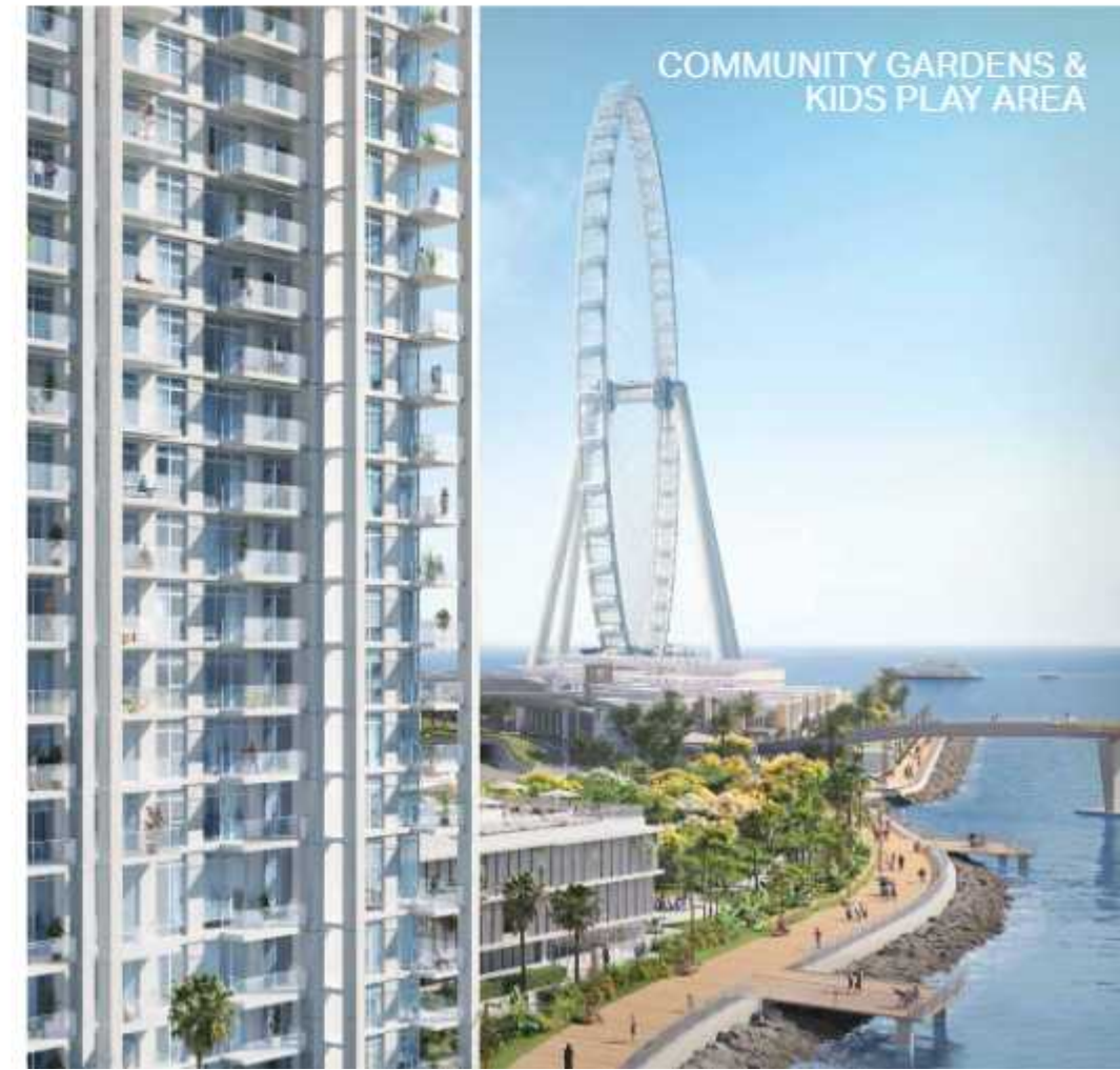
COMMUNITY GARDENS & KIDS PLAY AREA