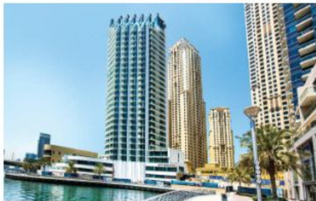
LIV RESIDENCE, DUBAI MARINA