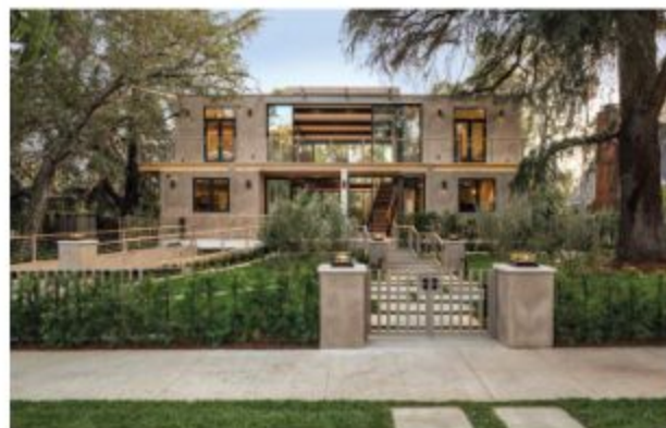
1105 BUENA VISTA, LOS ANGELES