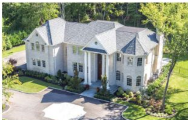
HICKORY, NEW YORK