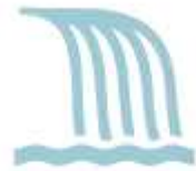
ICONIC WATER FEATURE