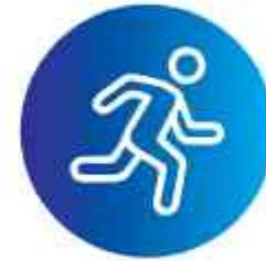
Sky Jogging Track