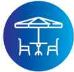
Outdoor Seating Area