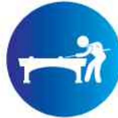
Party Hall with Billiards Room