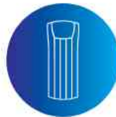
Lilly Pool with Water Beds