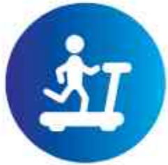
State-of-the-art Health Club