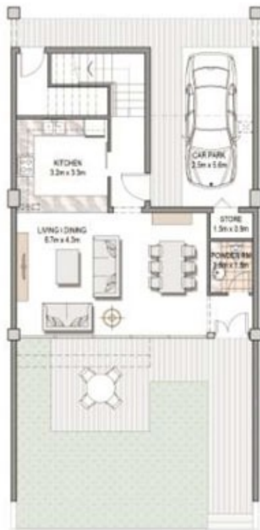
GROUND FLOOR PLAN GROUND