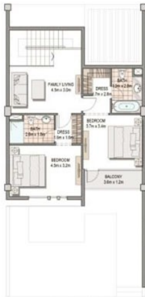
FIRST FLOOR PLAN FIRST FLOOR