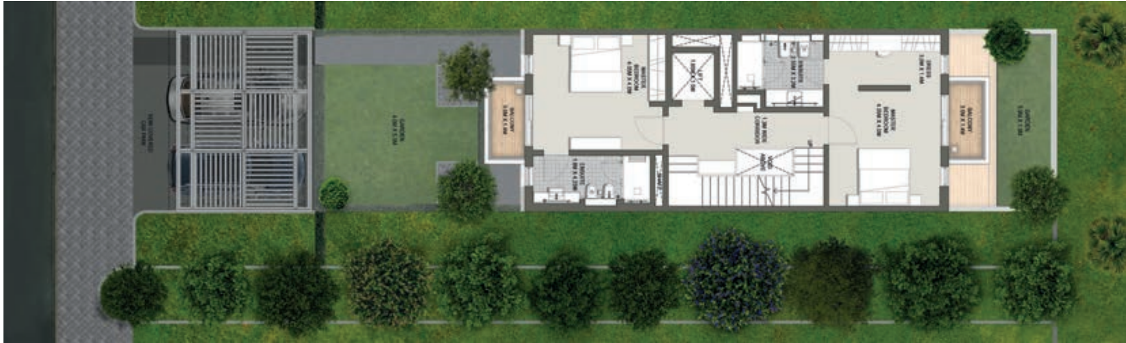
First Floor Saleable Area - 3,233 - 3,302 SQ.FT. 300.3 - 306.7 SQ.M.