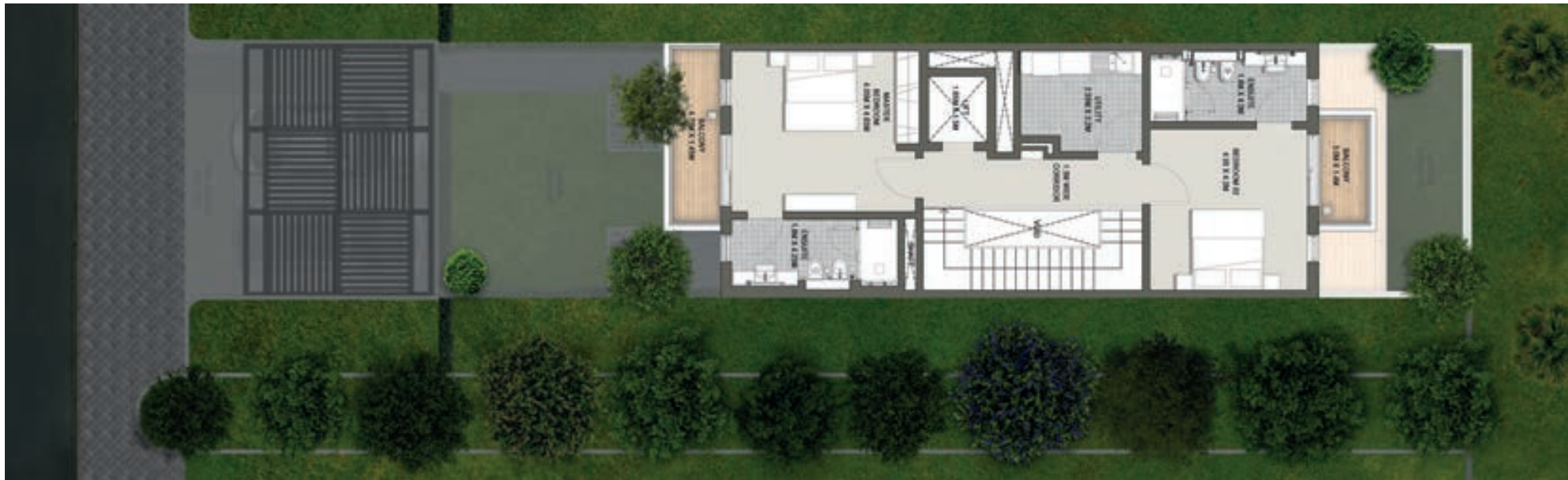
Second Floor Saleable Area - 3,233 - 3,302 SQ.FT. 300.3 - 306.7 SQ.M.