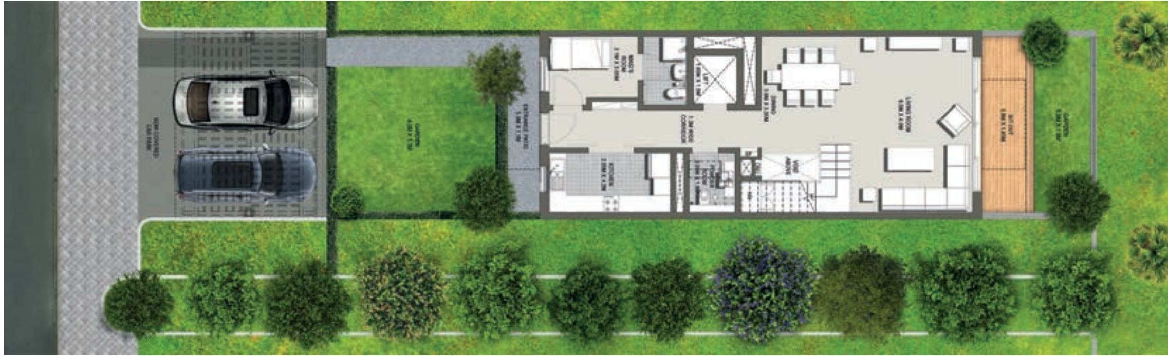
Ground Floor Saleable Area - 3,233 - 3,302 SQ.FT. 300.3 - 306.7 SQ.M.