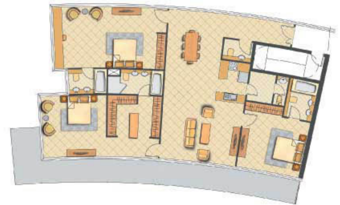
3 BEDROOM FLOOR PLAN