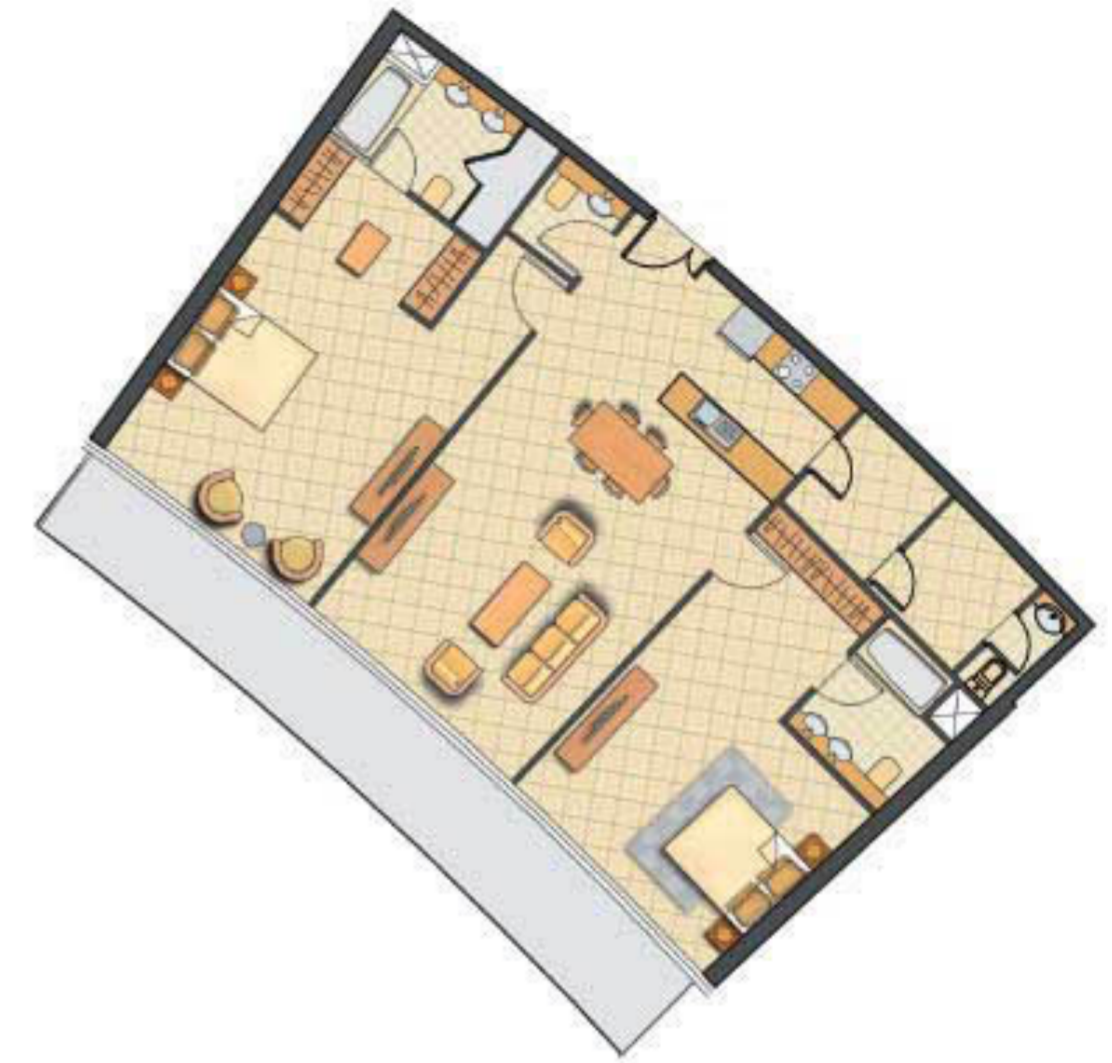
2 BEDROOM FLOOR PLAN