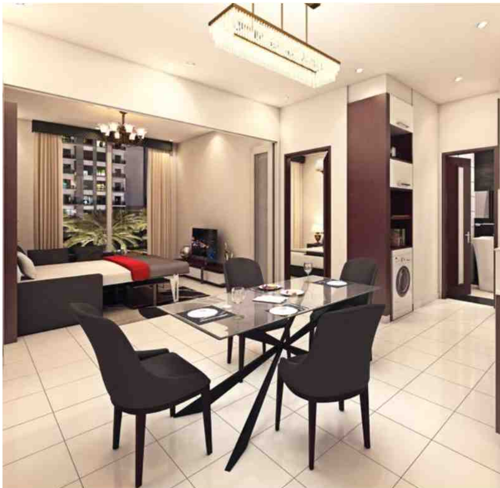
BEDROOM BY NIGHT

*Disclaimer: Please note that the apartments are unfurnished and furnishing will entail extra cost.