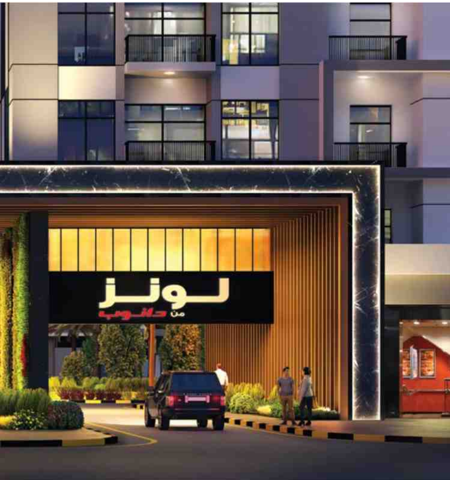
GRAND COMPLEX ENTRANCE