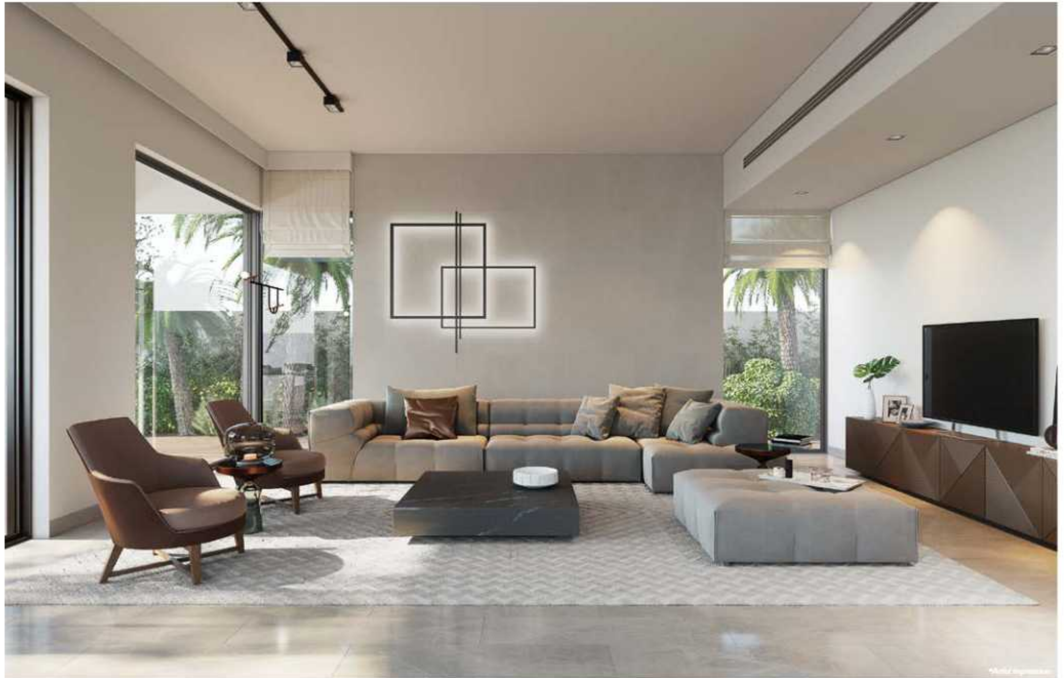
Living room - 4Br Luxury villa