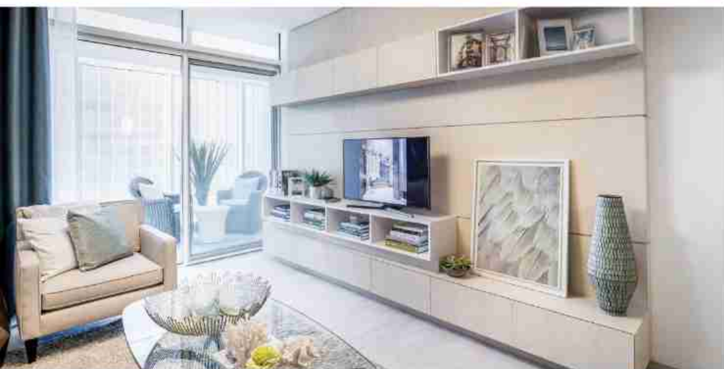
IMAGES FROM ACTUAL SHOW APARTMENT