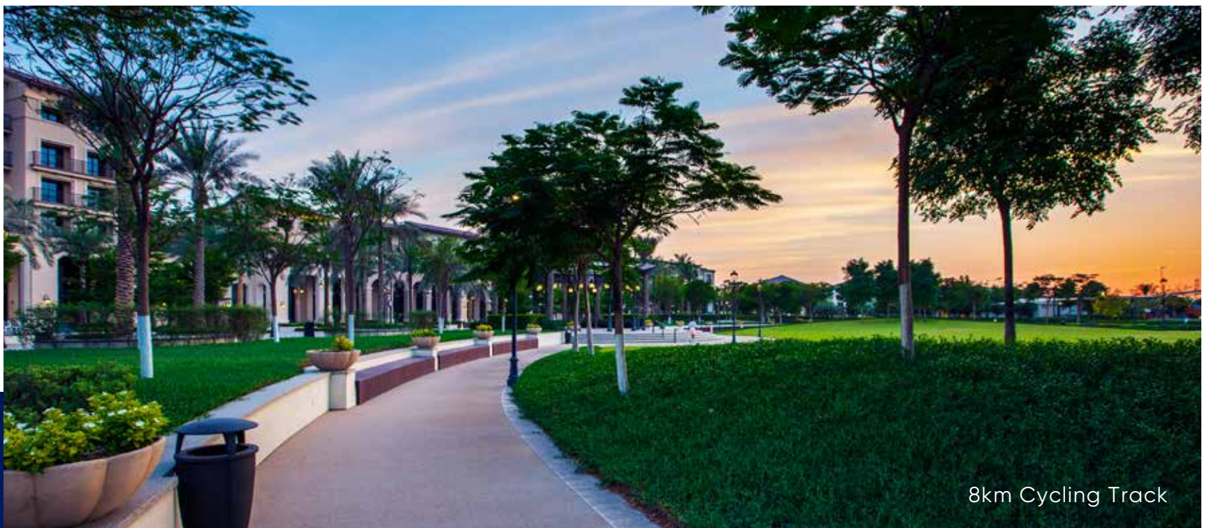
8km Cycling Track